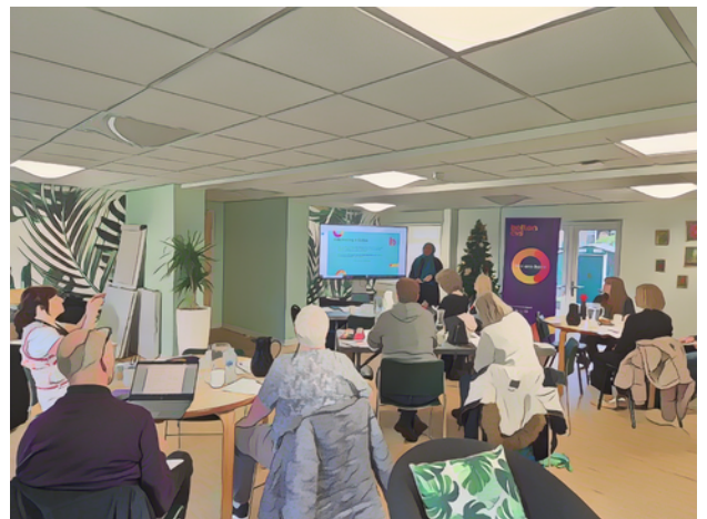
Bolton CVS Volunteer Development Network meeting