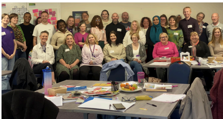
Bolton CVS Strategy Development at Staff Away Day

They have also reviewed the work of the Oldham Poverty Action Network (OPAN) and the associated test and learn projects to inform an investment and delivery plan.