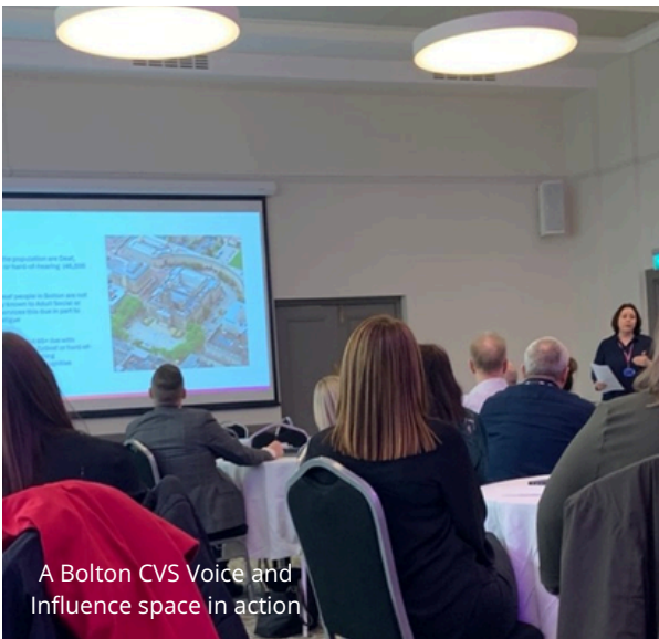
A Bolton CVS Voice and Influence space in action

Action Together in Oldham have continued to facilitate Oldham Poverty Action Network, which brings together people with lived experience of poverty with VCFSE groups and the public sector. They have also co-produced an 'inclusive recruitment toolkit', which is a blueprint for organisations and employers to remove barriers caused by inequalities to their recruitment processes.