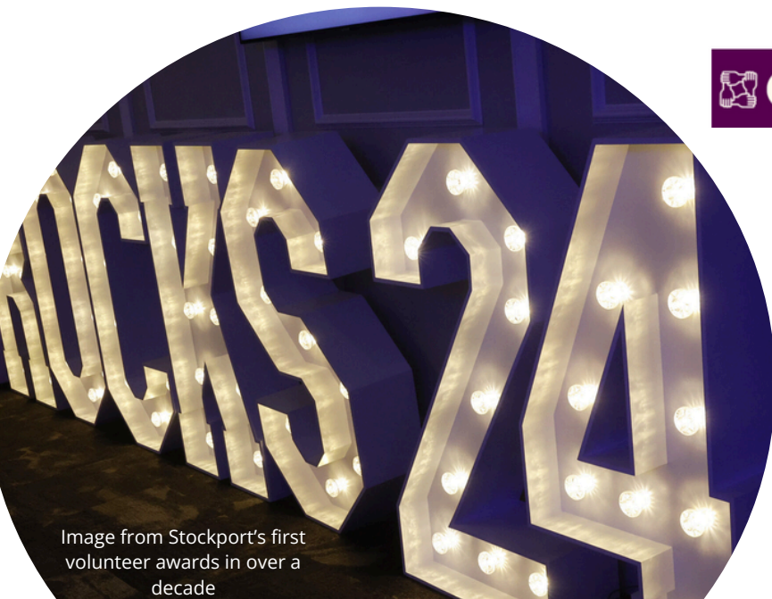
Image from Stockport's first volunteer awards in over a decade

Following the Proper Good business conference last quarter Sector3 have established a business club with 39 registered members. The business contacts have resulted in just under £30k of sponsorship for Stockport's volunteer celebration, Stockport Rocks.